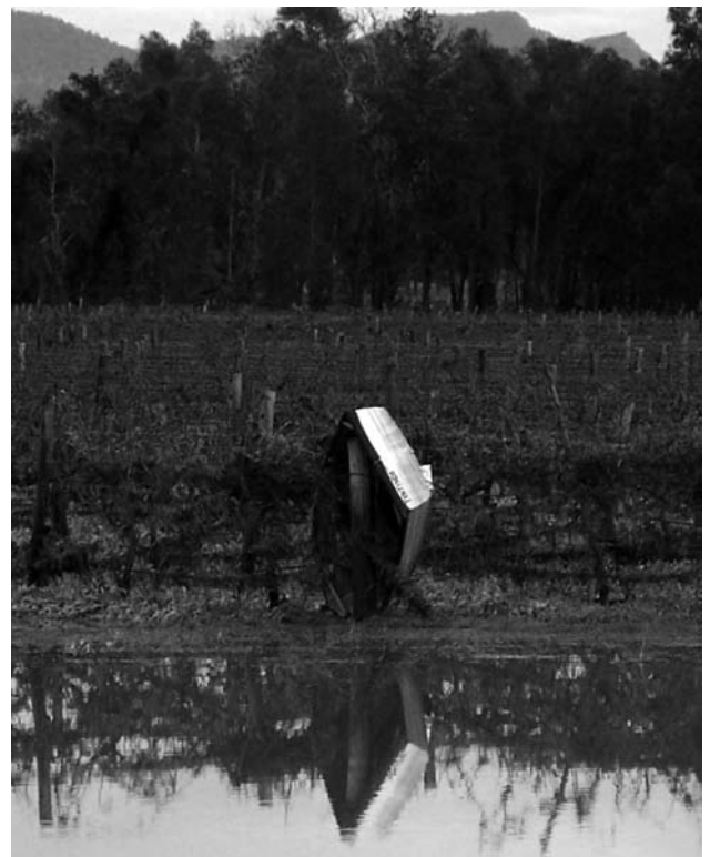
This is what we found after the downpour: the dinghy hanging off one of the vineyard posts. You can imagine how much water there was flowing through. Fortunately, the vines were dormant and they remained undamaged.

The good news is the vineyard got a thorough soaking and has set the new owners up for a fantastic 2008 vintage.